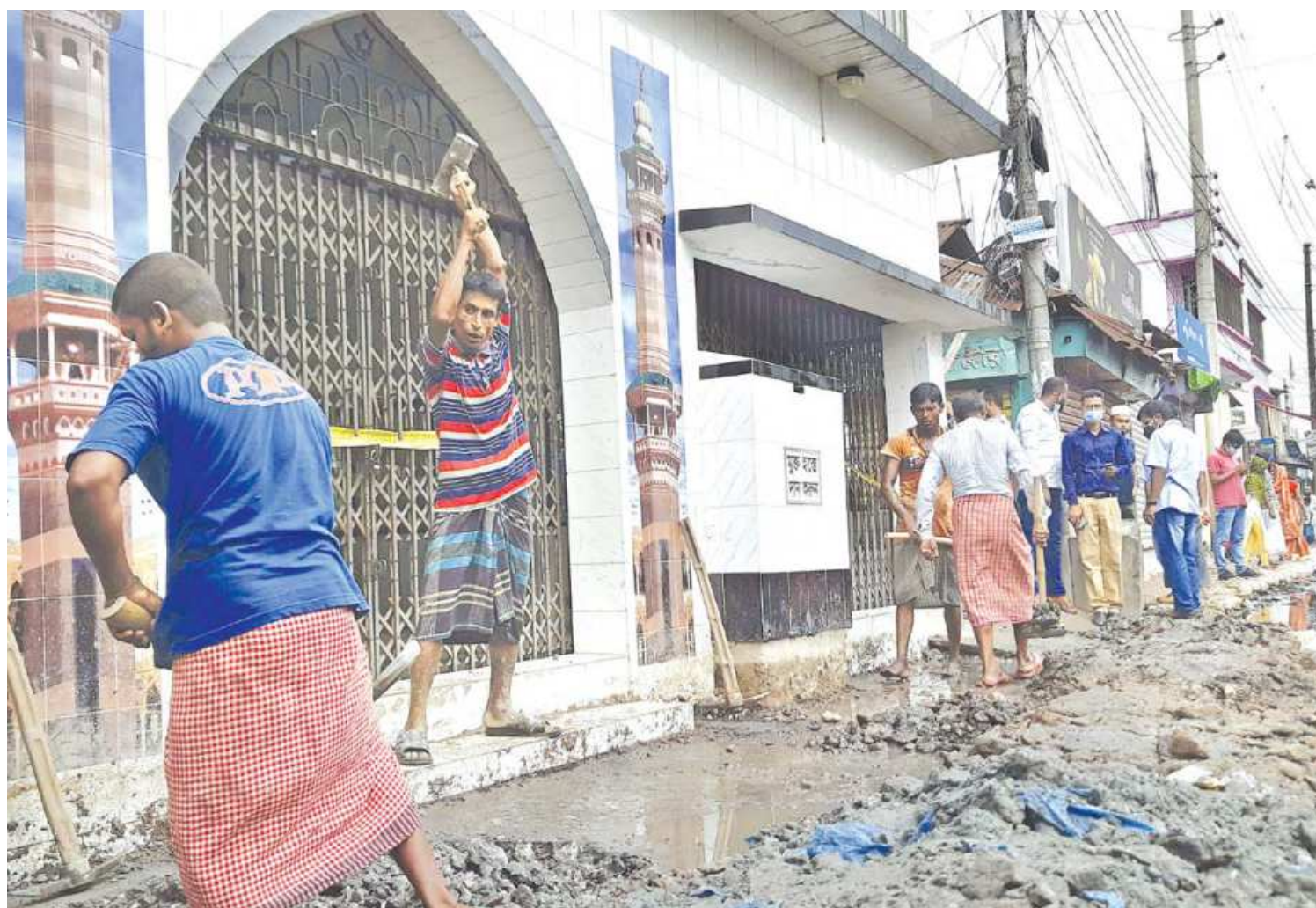
Workers hired by Titas Gas dig the ground in front of Pashchim Talla Baitus Salam Mosque in Narayanganj yesterday. Later in the day, a pipeline of Titas was found there. A fire at the mosque on Friday night, believed to be caused by gas from a leaking pipeline, killed 27 people and burnt a dozen others.