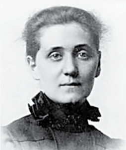
JANE ADDAMS (1860-1935) American social reformer.

Of all the aspects of social misery nothing is so heartbreaking as unemployment.