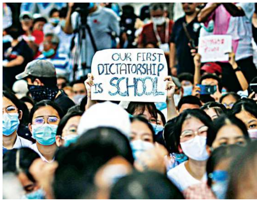
Anti-government protesters and students attend a demonstration demanding the government to resign, in front of the Ministry of Education in Bangkok, Thailand, yesterday.

Trump, who long touted his friendly ties with Chinese President Xi Jinping as he sought to make good on trade deal promises, has made getting tough on China a key part of his campaign for re-election in November.