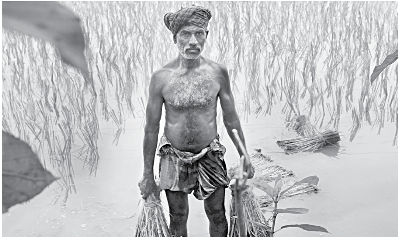
The farmer at Dhitpur village in Tangail Sadar upazila has incurred a loss of about Tk two lakh due to flood. His paddy field has been inundated with floodwater.

The flood damaged crops and vegetables like Aman paddy on