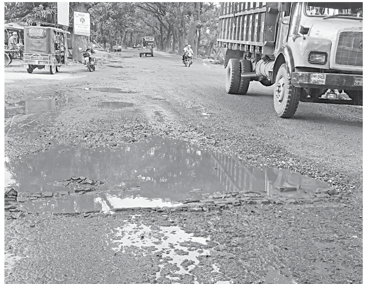
A truck passes by a large pothole on Jhenidah-Kaliganj highway. The photo was taken recently.