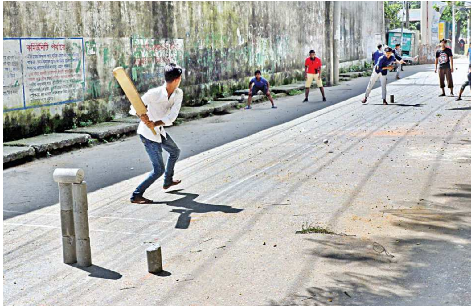
Standing in front of stumps fashioned from bits of sidewalk that are under construction, a young batsman is about to hit a ball in a game of street cricket in front of Tejgaon Adarsha School and College in the capital yesterday. Due to closure of schools since mid March amid the coronavirus pandemic, students of this school have not had access to the playground, but ensured that their games would not be sacrificed, even though face masks apparently were.