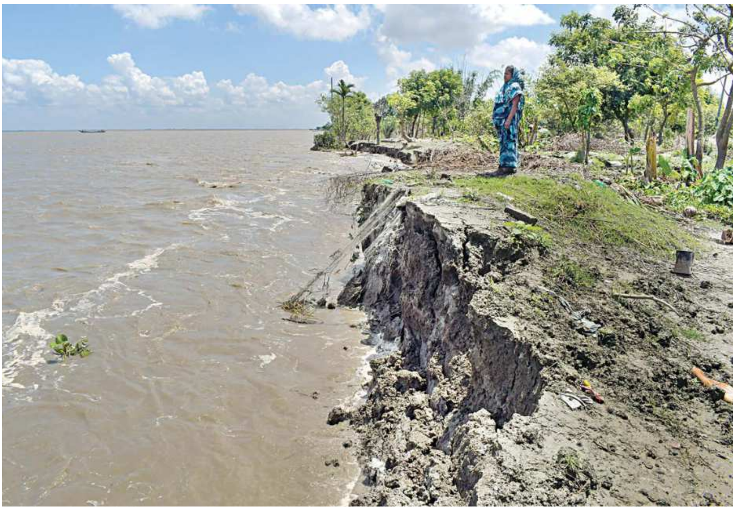
A woman standing near the precipice of an eroded bank in Manikganj's Harirampur upazila. The previous day, her house had fallen into the Padma river as a result of erosion. It is the fourth house she has lost because of such reason in the last 30 years. The photo was taken on Thursday.