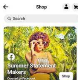
Facebook to add a "Shop" section in its app