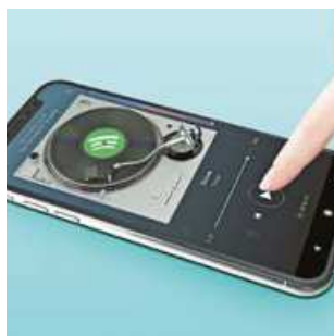
Spotify is working on a 'virtual events' feature