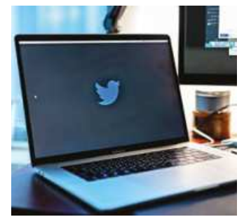
Twitter experimenting with adding 'Quotes' count to tweets