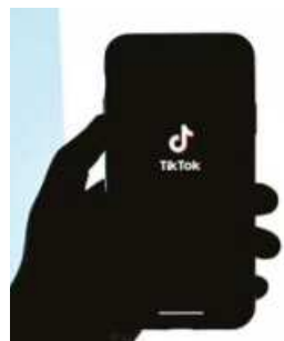
TikTok sues the U.S. government