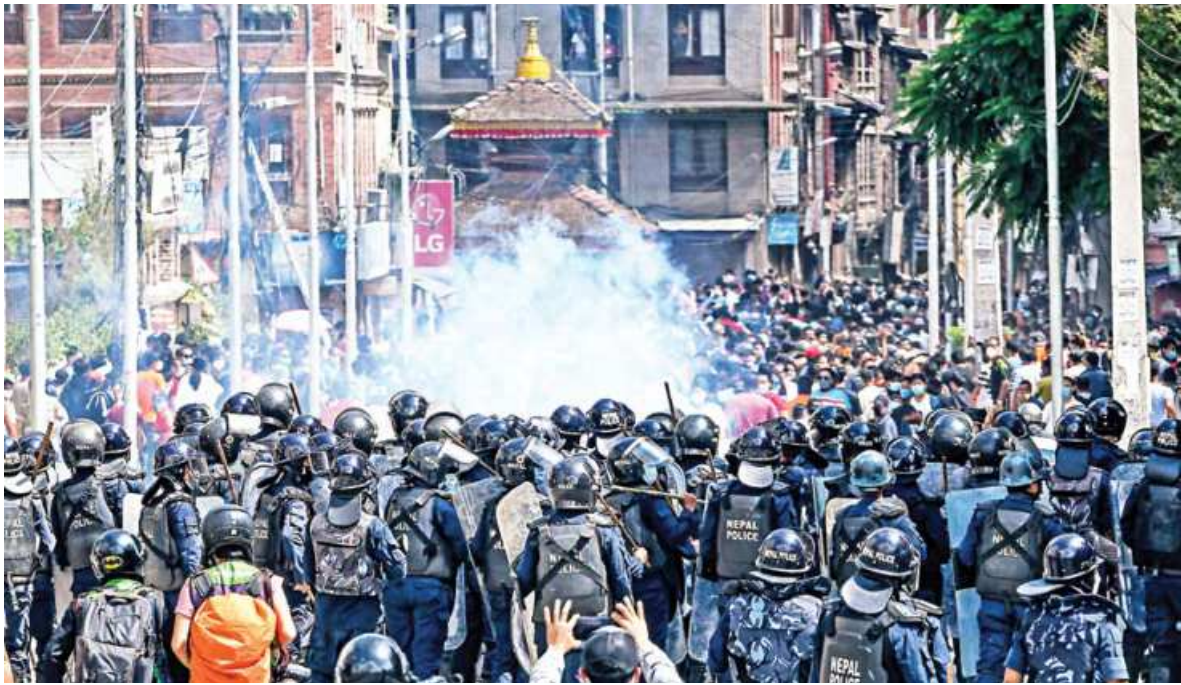
People throw stones during clashes with the police after authorities tried to halt the annual Buddhist chariot procession of Rato Machindranath amid restrictions to prevent spread of coronavirus in Lalitpur, on the outskirts of Kathmandu, Nepal yesterday.

The BNP leader urged the young generation to come forward and prepare for a strong struggle to get rid of the situation and “restore” democracy in the country.