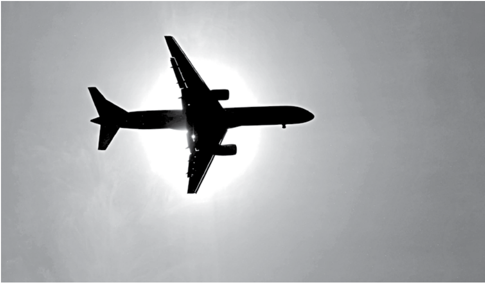
"To say my journey had been unusual would be the grossest understatement."

surgical gloves. She might have had shoe covers too but I forget. I was going to ask for tea but the thought of all the hands that had touched the teacups and spoons made me quickly decline, while bathing the little water bottle they gave me with hand sanitiser. I realised these two items, masks and hand sanitiser, have become the most crucial and precious items one can have at all times these days—more precious than the diamond ring that apparently guarantees faithful monogamy forever. Next Feb, instead