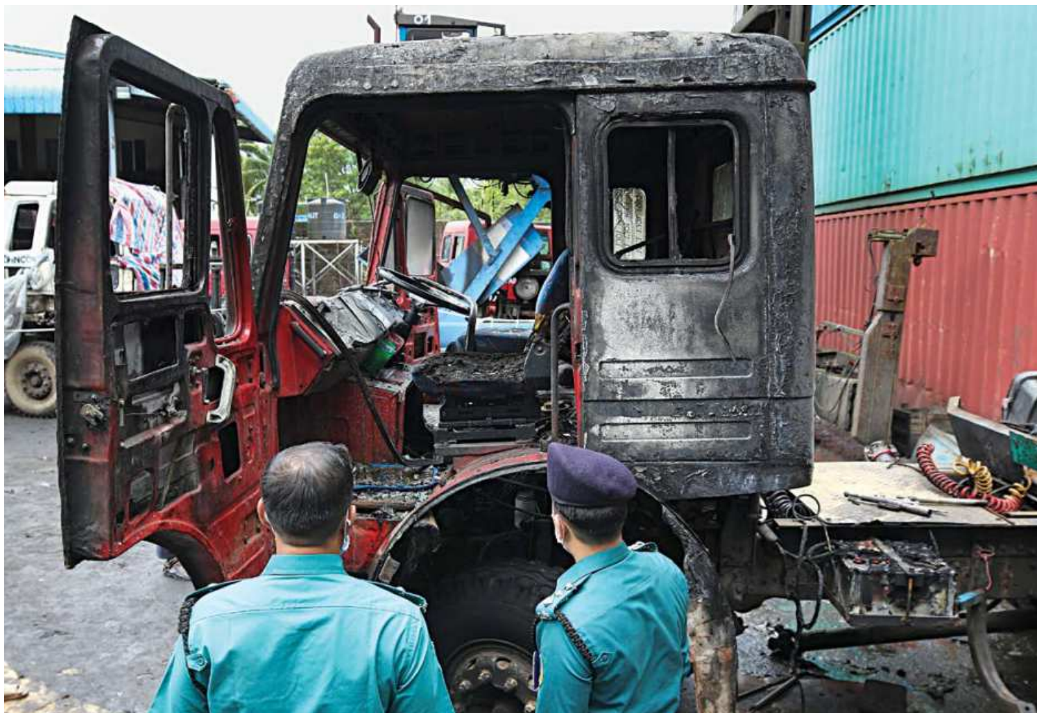
Police officers examine the charred remains of a semi-truck which caught on fire yesterday, killing three workers who were welding its fuel tank, at Incontrade Container Depot in Patenga area of Chattogram.