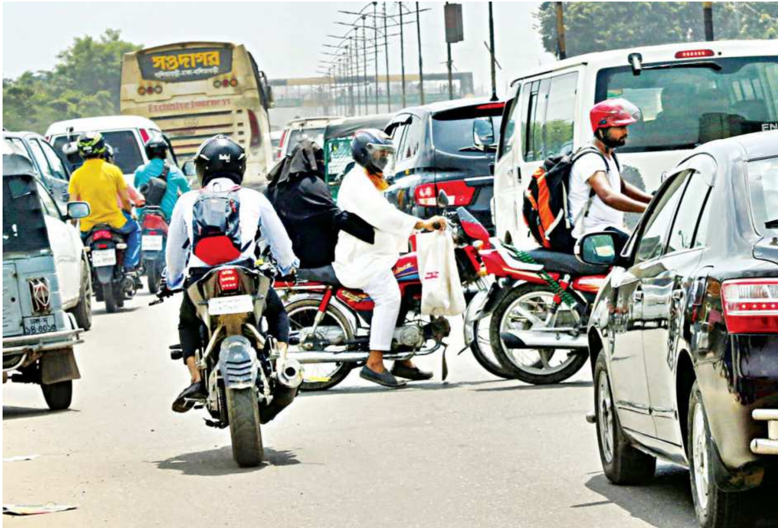
Halting traffic, motorcyclists go across the capital's busy Airport road just so they don't have to take the designated U-turn nearby. Such reckless and selfish acts often cause accidents claiming lives. The photo was taken yesterday.