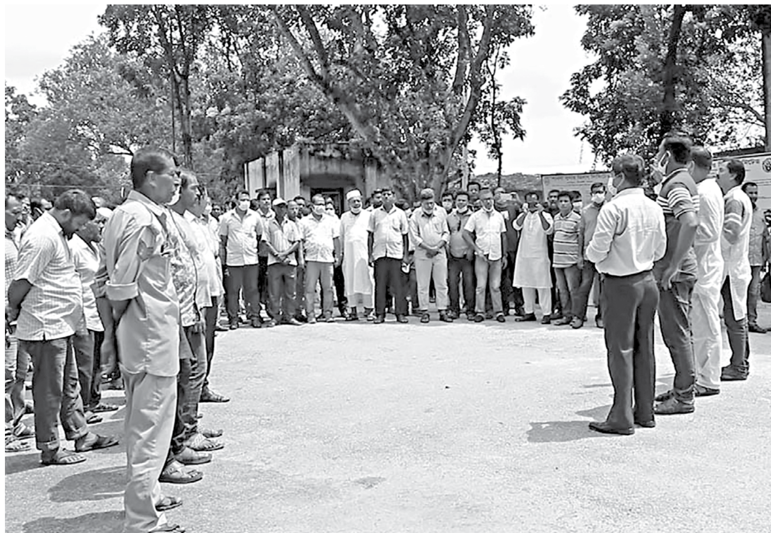
Agitated workers and employees of Pabna Sugar Mill in Pabna's Ishwardi upazila staged demonstration in front of the mill gate on Thursday to press for payment of six months' arrears.

The DAE official further said that they are providing seeds and fertilisers to the affected farmers in the areas. They are also giving technical assistance to the growers.