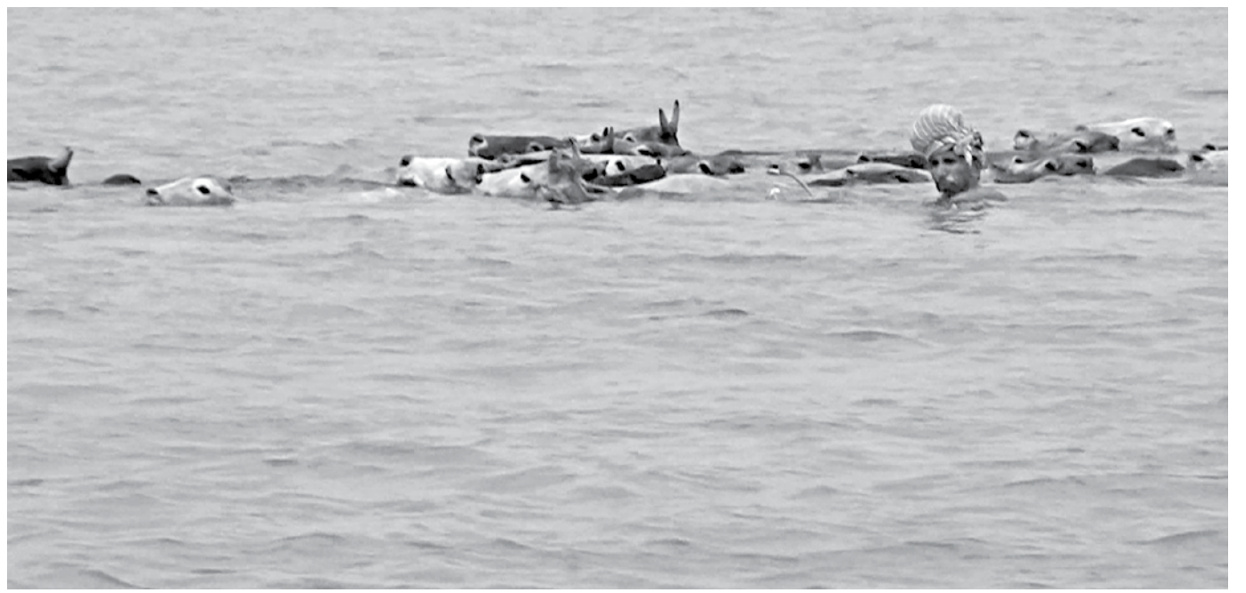
A farmer along with cows swims in the Brahmaputra river for grazing the cattle at Astamir char in Kurigram's Chilmari upazila.