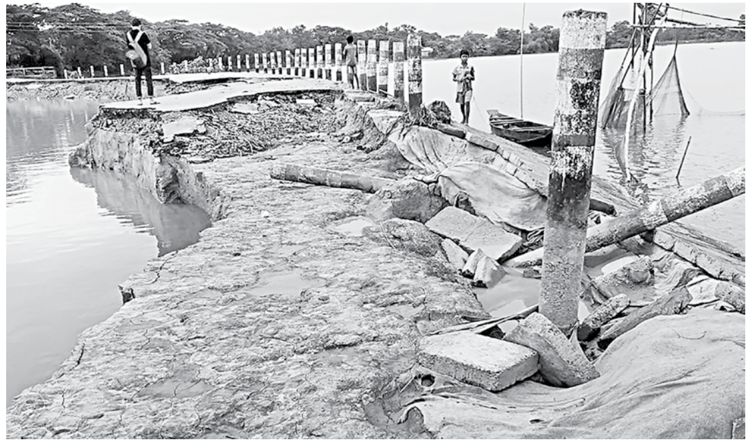
Thanks to three waves of floods in two months, this is what many parts of Sunamganj-Chhatak road now look like.

RHD was also working on to maintain communications by doing temporary repair work before an approval for permanent restoration work is received from the ministry, he also said.