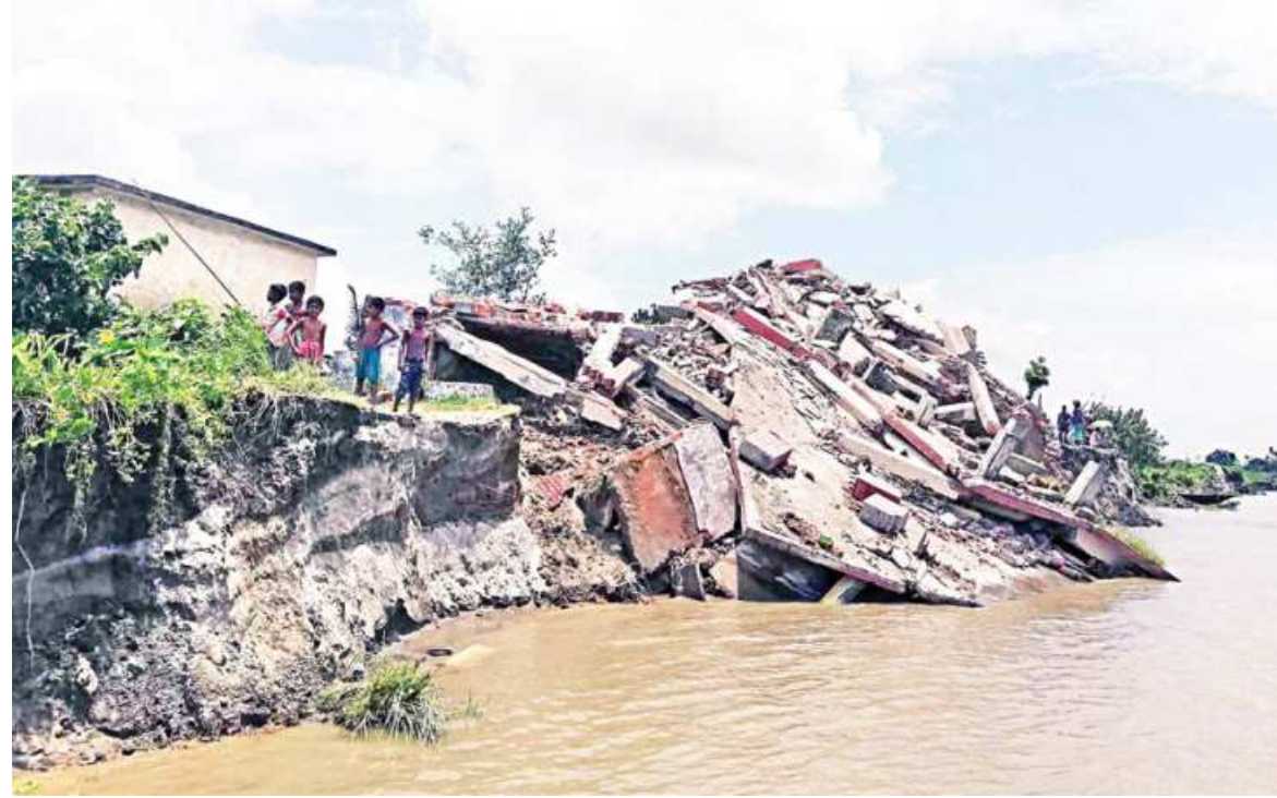
Paiksha Majhail Government Primary School in Tangail lies in ruins after being ravaged by the Jamuna. Many school buildings in the district have suffered a similar fate due to river erosion and ongoing floods. The photo was taken recently.

Some 100 competitors received certificates, signed by the PM, and prize money for securing various positions in the quiz competition under different categories.