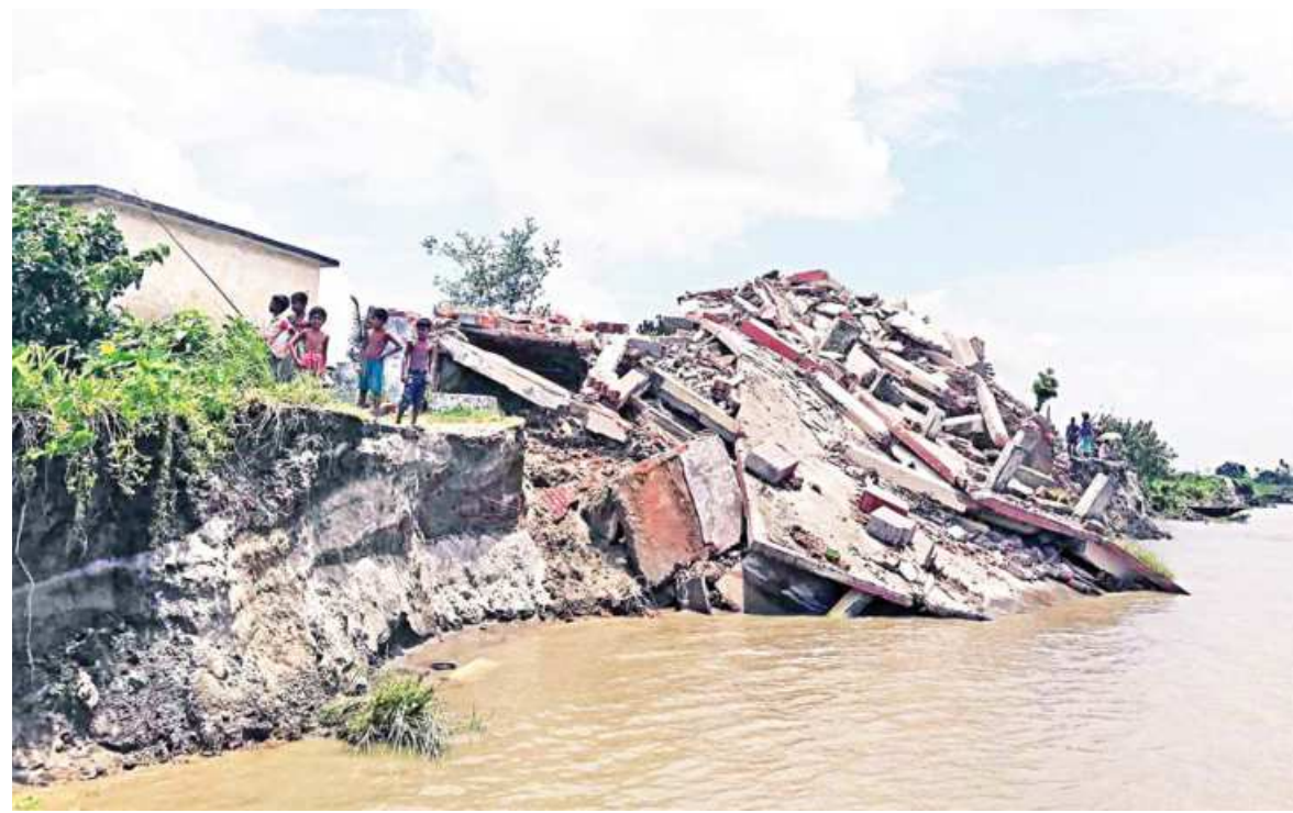
Paiksha Majhail Government Primary School in Tangail lies in ruins after being ravaged by the Jamuna. Many school buildings in the district have suffered a similar fate due to river erosion and ongoing floods. The photo was taken recently.

Some 100 competitors received certificates, signed by the PM, and prize money for securing various positions in the quiz competition under different categories.