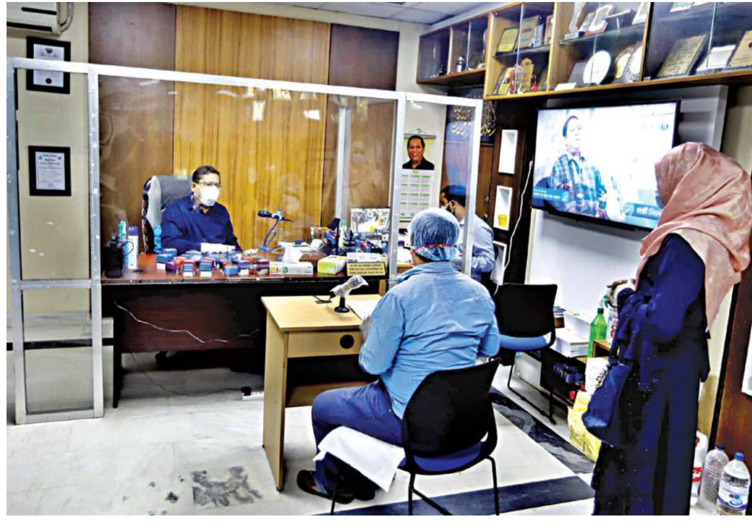
A doctor at Labaid Specialized Hospital in the capital set up a glass wall in front of his table to keep both his patients and himself safe from the highly contagious coronavirus. The doctor behind the glass is also using two face masks. The photo was taken Thursday.

In another autopsy of an elephant that died at Fasiakhali of Lama upazila in Bandarban, it was shown to be a natural death, though an electric metal wire was found close to the spot, according to eyewitnesses.