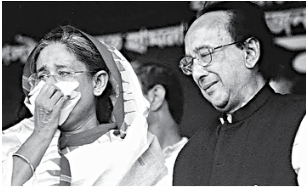
File photo of Awami League chief Sheikh Hasina and late President Zillur Rahman grieving for the victims of the August 21, 2004 attack at a rally held on October 3 that year. Rahman's wife Ivy Rahman, a Mohila Awami League leader, was also killed in the blast.

political authority realised the enormity of the attack. We may also recollect that the investigation of the incident was not taken in the right earnest. The first indication of that was the failure to preserve the scene of the occurrence. There were allegations that physical evidence was tampered with or destroyed, and the field units did not act with the desired speed and circumspection. The question is, did this happen because of a so-called instruction from above? If then, the culpability of all concerned, high and low, needs to be