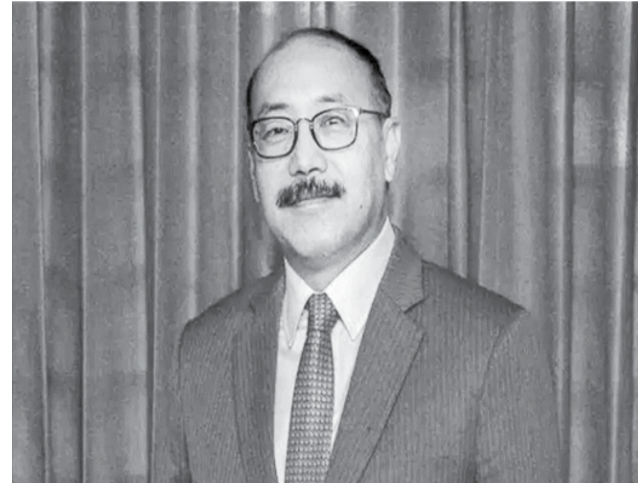
Indian Foreign Secretary Harsh Vardhan Shringla.