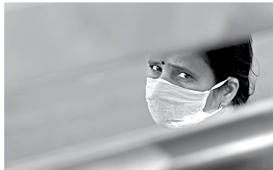
Cash transfer programmes are an effective way to counter the adverse socioeconomic consequences of external shocks like Covid-19.

For Pakistan, this was a watershed moment in terms of government functioning. The crisis compelled the government to be more responsive, data-driven, experimental, and ambitious. Cost-effective digital methods of working, new ways to coordinate the activities of multiple stakeholders, and a whole-of-government approach have been institutionalised. These measures