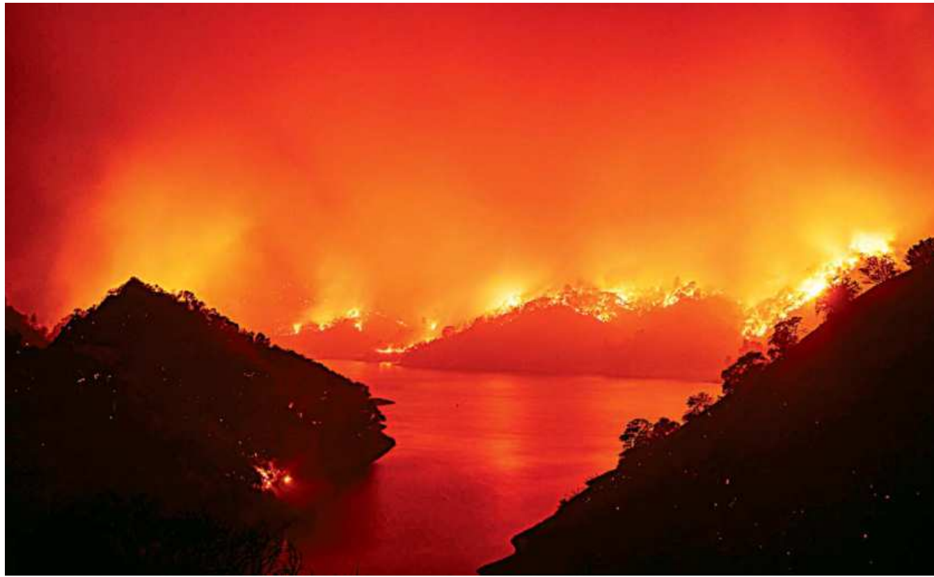
Flames surround Lake Berryessa during the LNU Lightning Complex fire in Napa, California, on Wednesday. Thousands of people fled their homes in northern California on Wednesday as hundreds of fast-moving wildfires spread across the region, burning houses and leading to the death of a helicopter pilot.