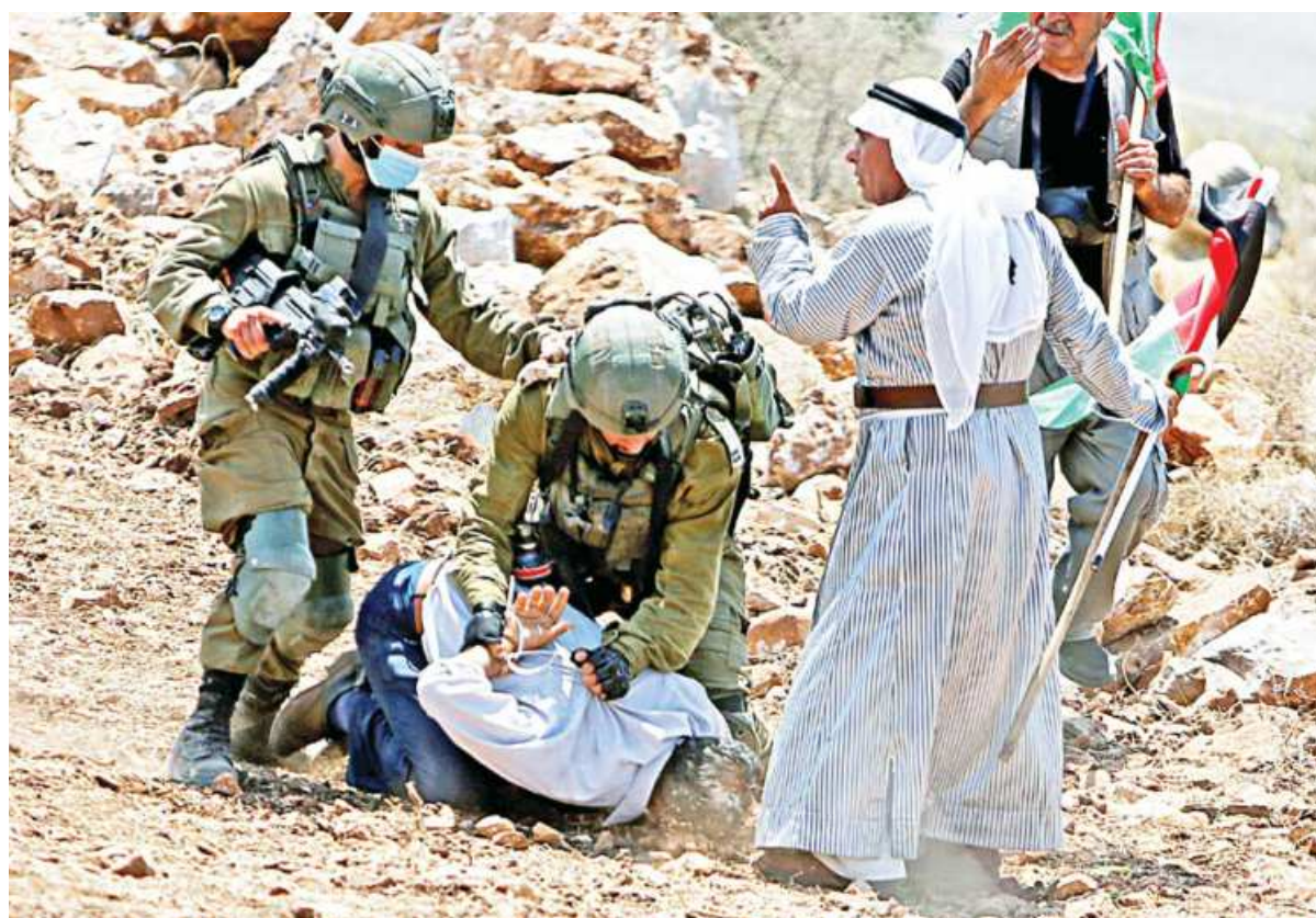
Israeli soldiers detain a Palestinian demonstrator during a protest against Jewish settlements near Tulkarm in the Israeli-occupied West Bank, yesterday.

Thai police yesterday said they have arrested four anti-government activists over a July 18 protest that triggered a wave of student-led demonstrations demanding a new constitution and elections.