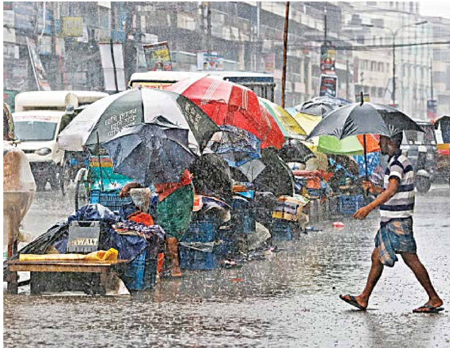
Sporadic rain continued to trouble residents of Dhaka over the last week, as a result of a depression at the Bay of Bengal. Some of the worst sufferers of the downpour were street hawkers, many of whom have resumed their business after months due to the Covid-19 pandemic. The photo was taken earlier this week from the capital's Mirpur-1.