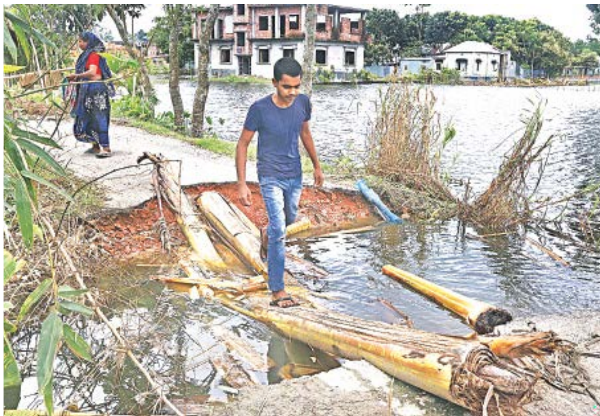
A young man steps onto a makeshift bridge made out of banana trees to cross a road in Manikganj's Shingair upazila that has been eroded as a result of flooding. This photo was taken on Wednesday.

The webinar was broadcasted live from the official Facebook page of Eminence Associates for Social Development.