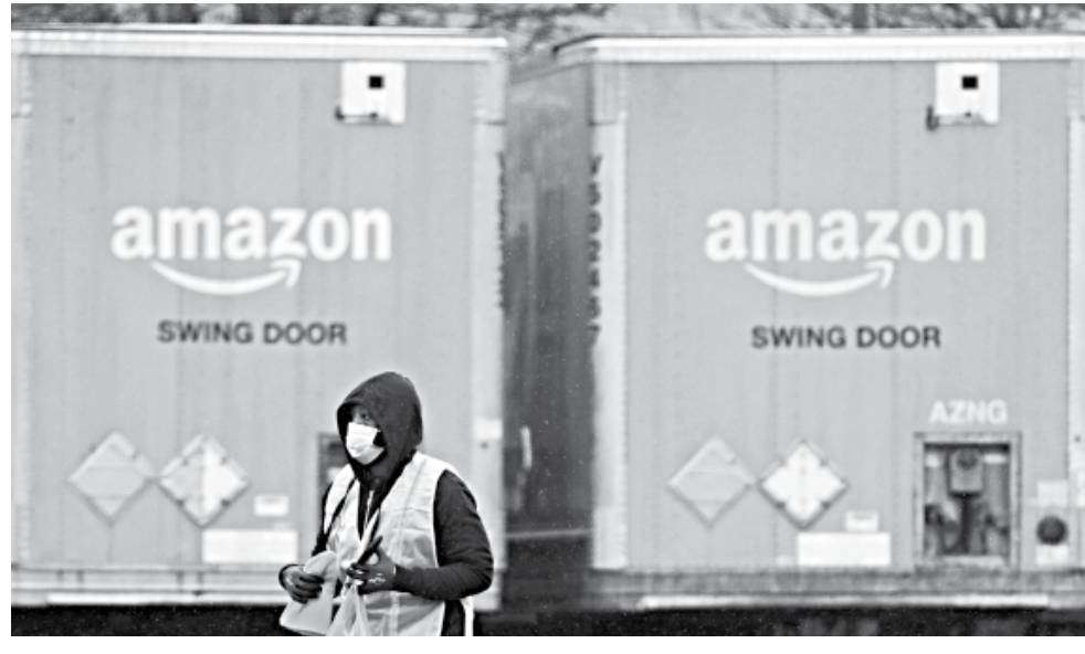
File photo of a worker wearing a face mask in front of trucks parked at an Amazon facility at Bethpage on Long Island, New York.