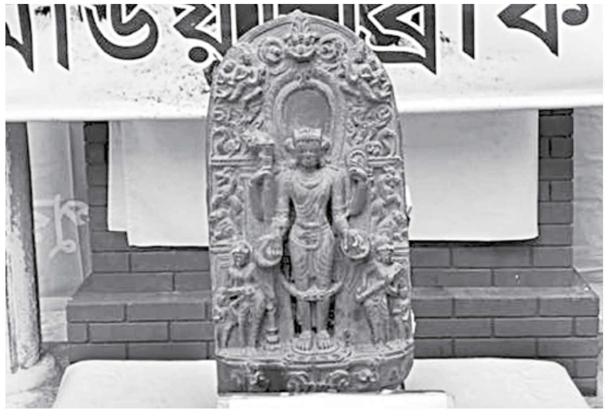
Members of Rapid Action Battalion (Rab) seized this 20kg touchstone statue of Hindu goddess Saraswati from Dinajpur's Kaharol upazila recently. They also arrested two people in this connection.