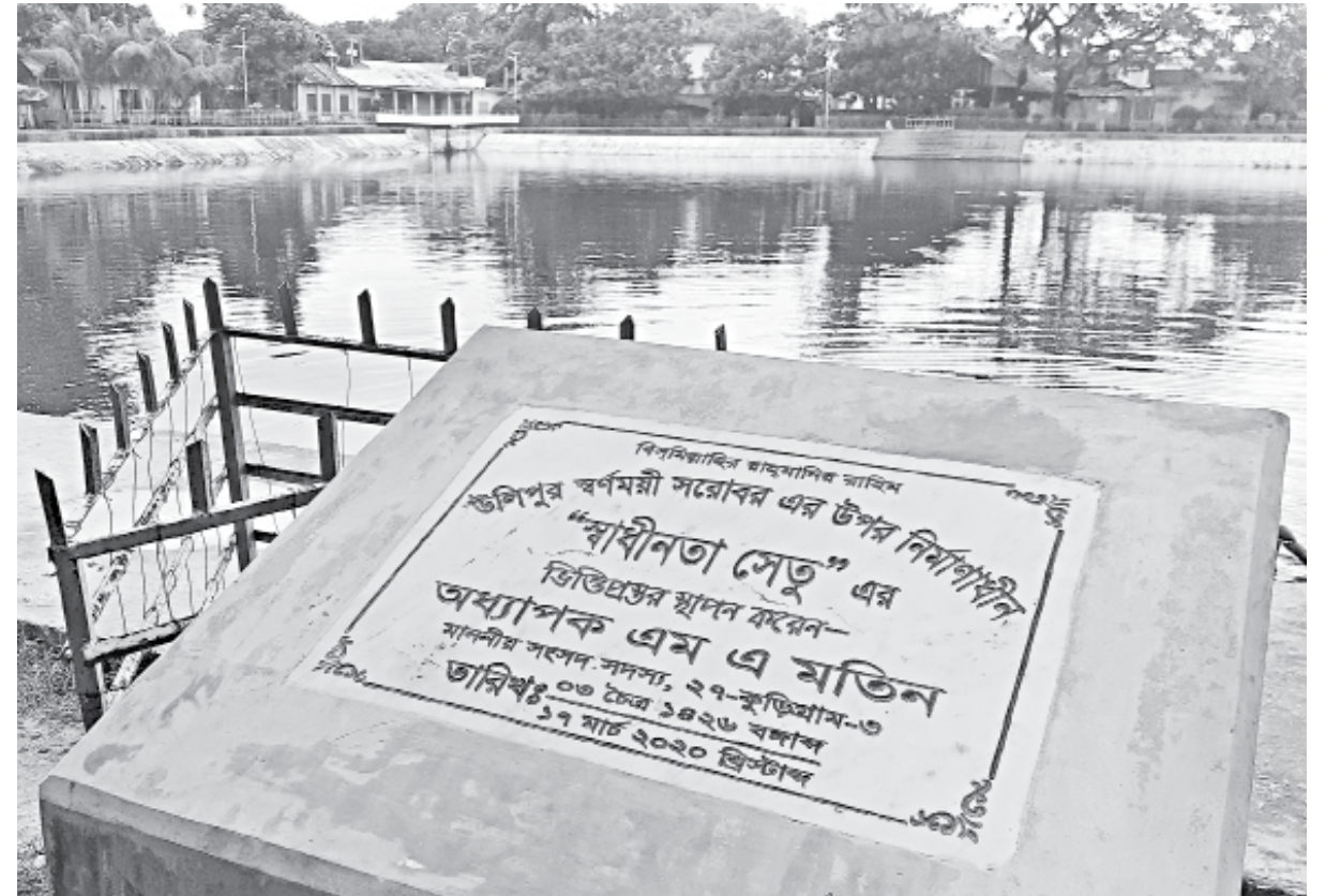
The local lawmaker laid the foundation stone for construction of a bridge styled 'Swadhinata Setu' over the traditional 'Swarnamoyee Sarobar' in Ulipur upazila town under Kurigram on March 17 this year. The initiative is meant for beautification of the area, said organisers.

If the decision to construct the bridge is not revoked, the people of Ulipur will launch a bigger movement, he said.