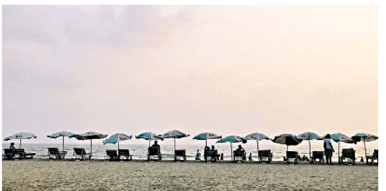
Sunset in Kolatoli Beach, one of the tourist haunts in Cox's Bazar.