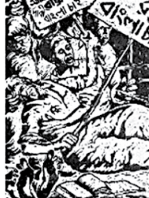
Bloody 21st 1952 (Linocut)

decade for Baseer. In 1960, an exhibition of his paintings, drawings and lithographs was organised by the Pakistan Arts Council in Lahore. His second exhibition in Lahore displayed 28 of his works and were completely different from his