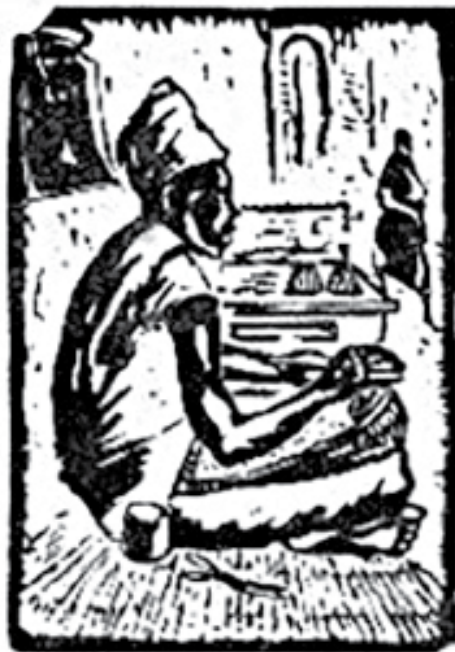
Biriwala 1954 (Linocut)