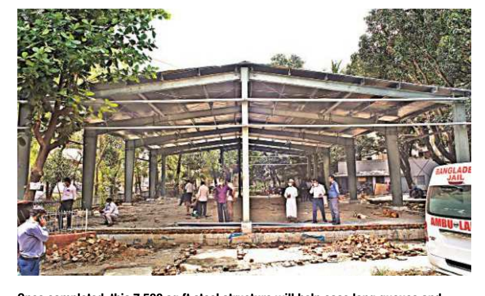
Once completed, this 7,500 sq ft steel structure will help ease long queues and serve additional patients. The photo was taken last week.

Long-awaited expansion work near completion