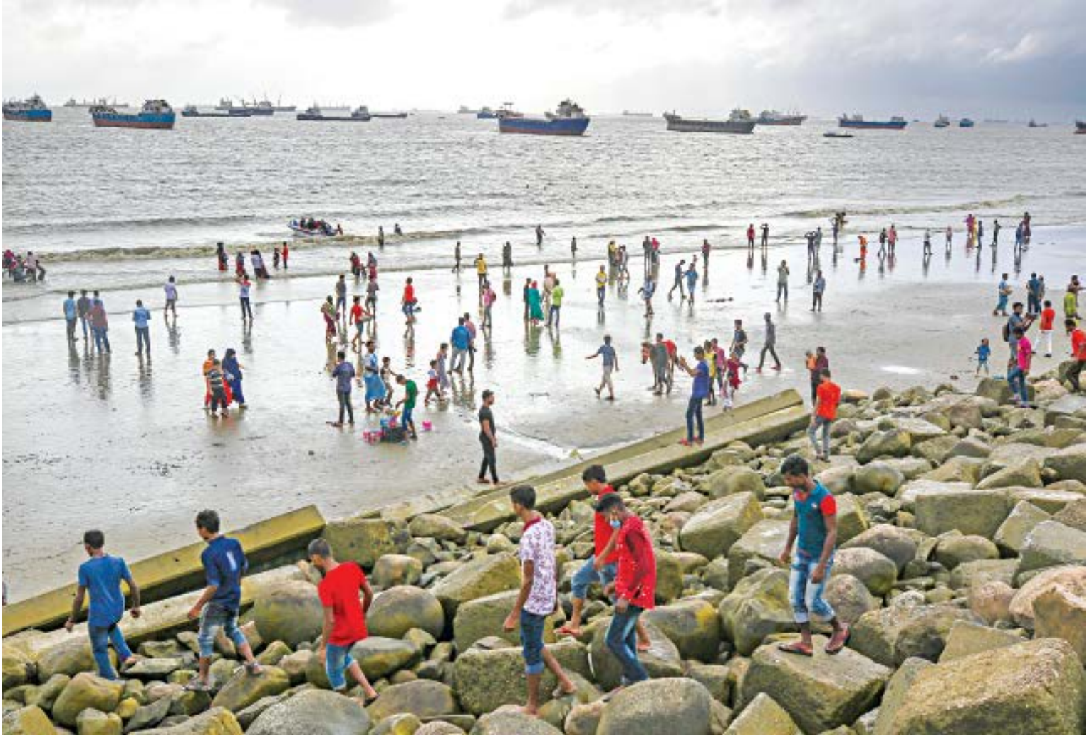
People throng Patenga beach in Chattogram yesterday after the authorities opened the tourist spot after keeping it closed for months due to the pandemic. Many stuck in homes for weeks and months decided to go to the beach in the afternoon and some stayed there well after sunset.