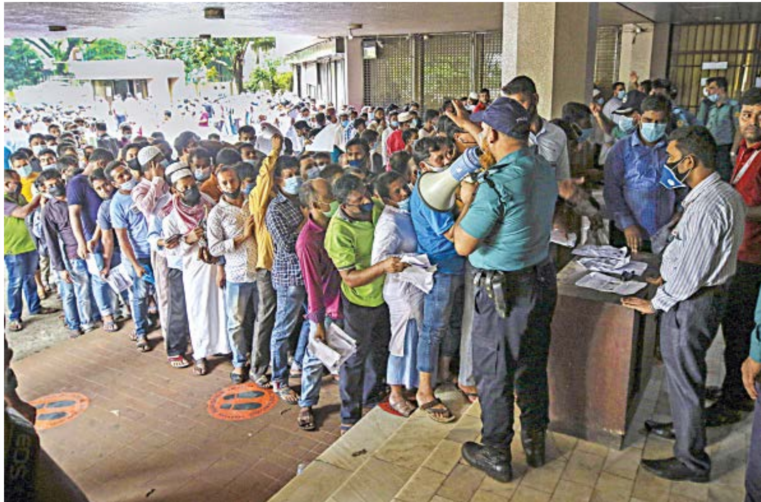
Expatriates returning to the Middle East gathered at the Biman Bangladesh Airlines office in Chattogram for plane tickets. Authorities also recruited Panchalish police to deal with the large number of ticket seekers on Tuesday. Many expatriates have shown frustration and anger as they have had to return after waiting for long hours and not getting a ticket. Many who came to the country during pandemic have been told that their visas would be canceled if they do not arrive at their workplace before the end of the holiday.