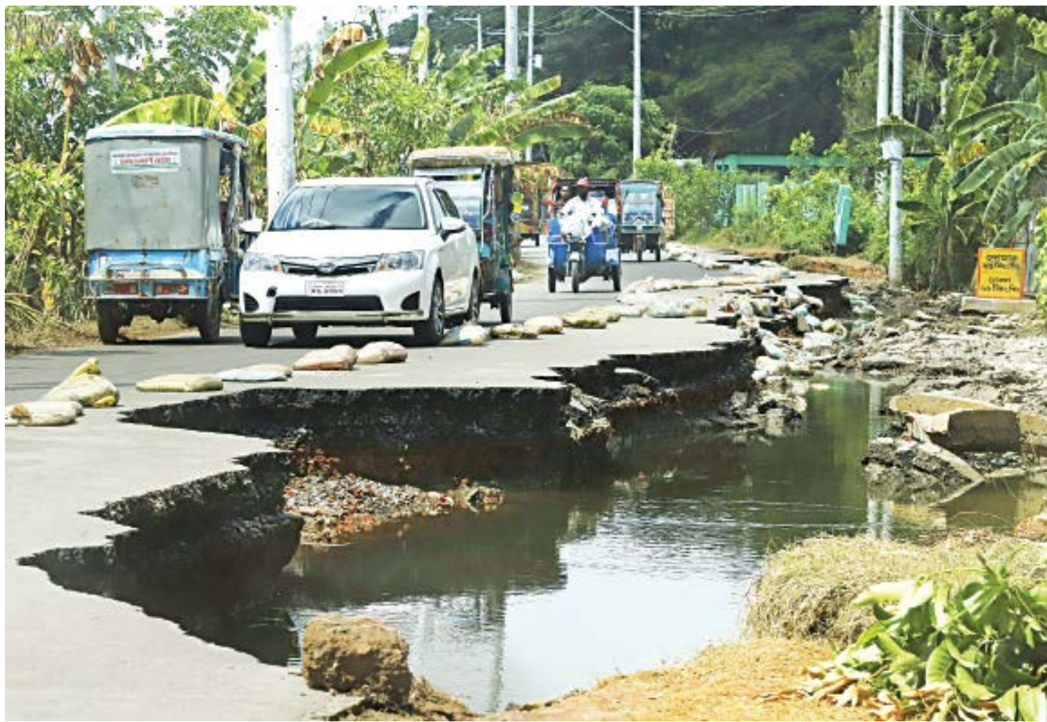
Cars plying Munshiganj's Sreenagar-Dohar road, which is lined with sandbags as it has been heavily damaged due to floods caused by the overflowing of the Padma. Due to enormous cracks, heavy and goods-laden vehicles are not permitted on the road until repair. The photo was taken recently.