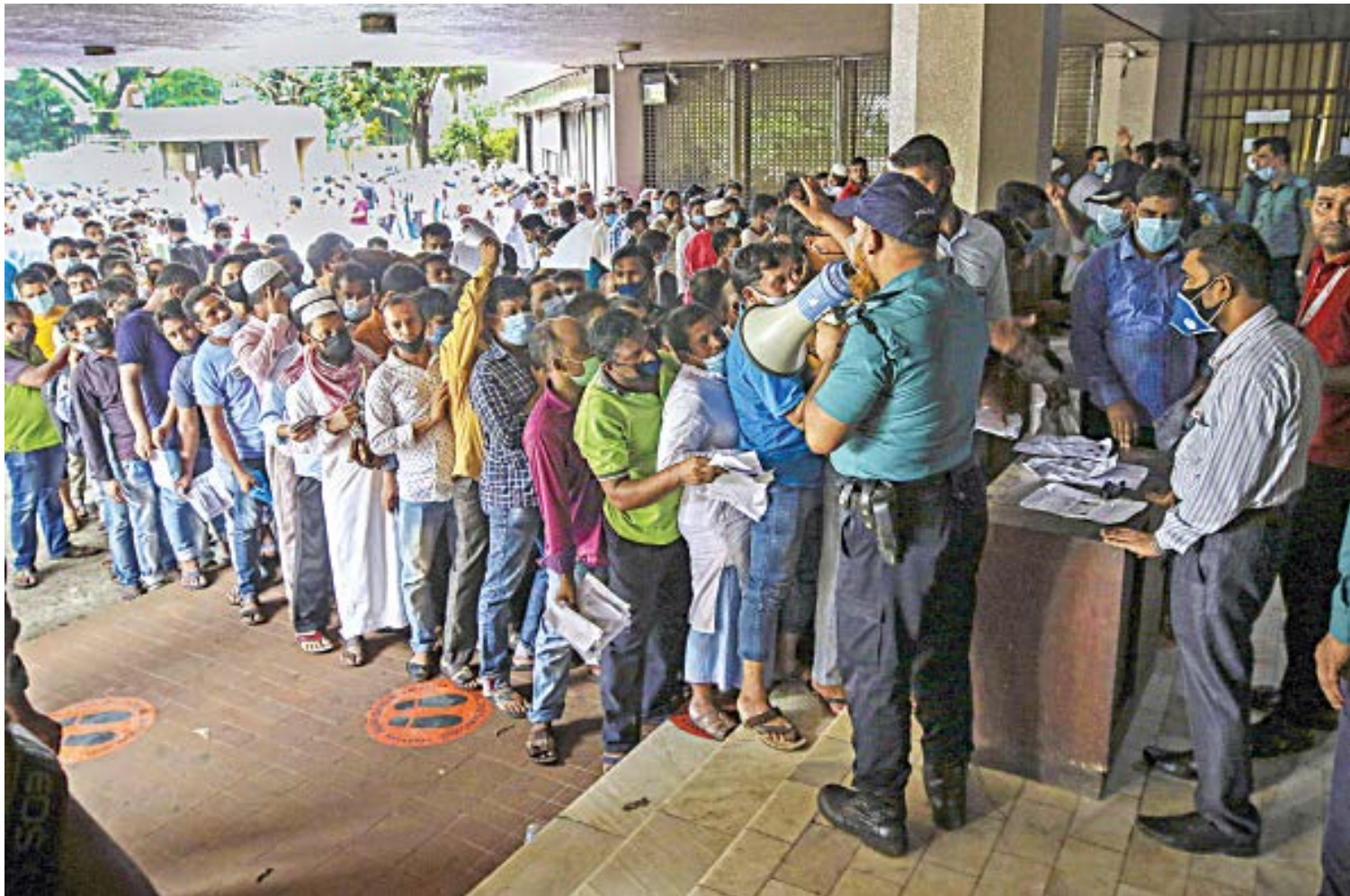
Expatriates returning to the Middle East gathered at the Biman Bangladesh Airlines office in Chattogram for plane tickets. Authorities also recruited Panchalish police to deal with the large number of ticket seekers on Tuesday. Many expatriates have shown frustration and anger as they have had to return after waiting for long hours and not getting a ticket. Many who came to the country during pandemic have been told that their visas would be canceled if they do not arrive at their workplace before the end of the holiday.