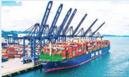
24,000-TEU vessels HMM is putting into service, the largest of their kind in the world and costing $143-151 million each. The first of the class to begin operations, the 23,964-TEU HMM Algeiras, made its maiden voyage in April when it set a new world record for shipment volume. HMM St Petersburg will be delivered in September and make its maiden voyage to Shanghai and other Chinese ports, before heading through the Suez Canal to Rotterdam, Hamburg, Antwerp, and London.

On the bridge of one of the world's biggest container ships, a worker in a grey protective suit installs the compass that will guide the leviathan across the world. The finishing touches are being put to the HMM St Petersburg at the Samsung Heavy Industries shipyard on the island of Geje, at the southern tip of South Korea. Deep in the bowels of the enormous vessel, welders are dwarfed by the giant engines that will propel it at a maximum speed of over 22 knots. At 400 metres (1,300 feet), the HMM St Petersburg is 100 metres longer than the Eiffel Tower, and 62 metres wide. It has a capacity of 23,820 TEU (twenty-foot equivalent units, the standard measure of a shipping container), which owner Hyundai Merchant Marine (HMM) describes as enough to carry seven billion choco-pies, a popular Korean snack -- one for every human being on the planet. It is the 12th and last of a new class of