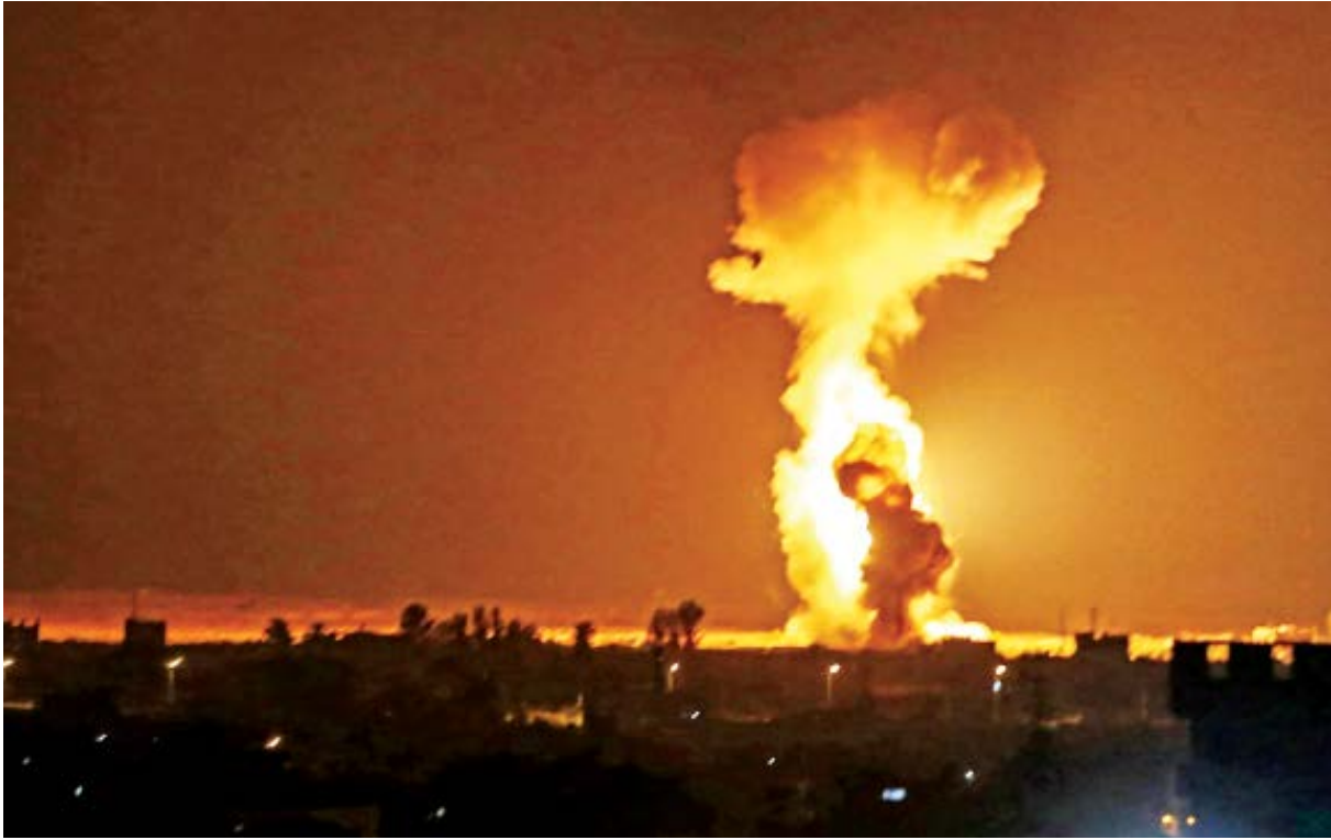
Smoke and flames rise after war planes belonging to the Israeli army carried out airstrikes over the southern Gaza Strip city of Rafah yesterday. The army said the strikes were "retaliation" for the launching of multiple balloons from the Hamas-run enclave in recent days. No casualties were reported. Jets, attack helicopters and tanks struck a number of Hamas targets including "underground infrastructure and observation posts," a statement said.

home orders, and millions more at risk of a wider outbreak, Ardern said she was seeking advice on delaying the election currently scheduled for September 19. Parliament was due to be dissolved yesterday to allow the election to take place, but the centre-left leader held off the move until Monday to monitor how the crisis evolves. With the number of coronavirus cases worldwide surpassing 20 million and the number of deaths fast approaching 750,000, the World Health Organization has warned that a second wave is "almost inevitable". Countries across the globe are starting to reintroduce restrictions as the number of infections tick higher. In Belgium, which is battling one of the most serious coronavirus outbreaks in Europe, authorities made the wearing of face masks in public compulsory in the Brussels region from Wednesday. In Italy, too, regions have begun to order new quarantines for people returning from higher-risk European countries such as Spain as they hope to stem new outbreaks.