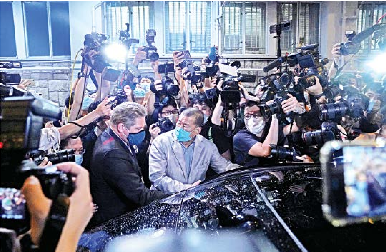
Media mogul Jimmy Lai Chee-ying, founder of Apple Daily, is seen as he was released on bail, after he was arrested by the national security unit in Hong Kong, China, yesterday. The 71-year-old was cheered by staff and handed a bouquet yesterday as he returned to the newsroom following a late night release on bail after 40 hours in custody. In images broadcast live on Facebook by his own reporters, he told staff to continue the fight for democracy through journalism defying the odds.