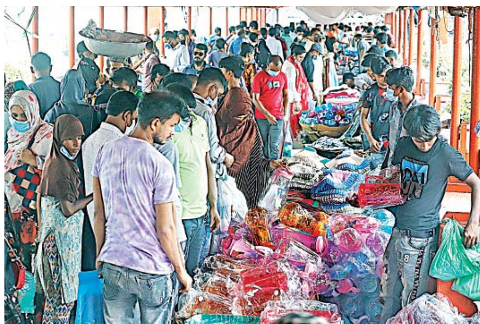
A jam-packed New Market in July.

The Washington-based multilateral lenders -- the World Bank and the International Monetary Fund -- had forecasted that the economy would grow between 1.6 per cent and 3.8 per cent in fiscal 2019-20 for the pandemic-whiplash, while the Asian Development Bank said the Bangladesh economy would expand at 4.5 per cent. Standard Chartered forecasted