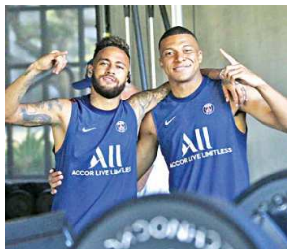
Neymar yesterday uploaded this picture on his social media accounts of himself with his PSG teammate Kylian Mbappe as the Parisiens prepare for the Champions League quarterfinal against Atalanta on Wednesday.