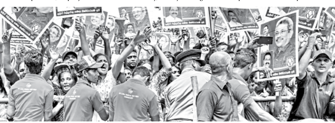
Crowds at a rally in Sri Lanka showing their support for the Rajapaksa brothers

The government is now likely to push to amend the 19th amendment to the constitution, which is one of the poll promises. This amendment diluted the power of the executive president as