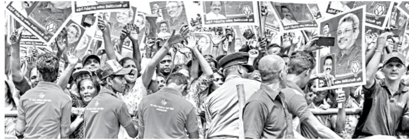
Crowds at a rally in Sri Lanka showing their support for the Rajapaksa brothers