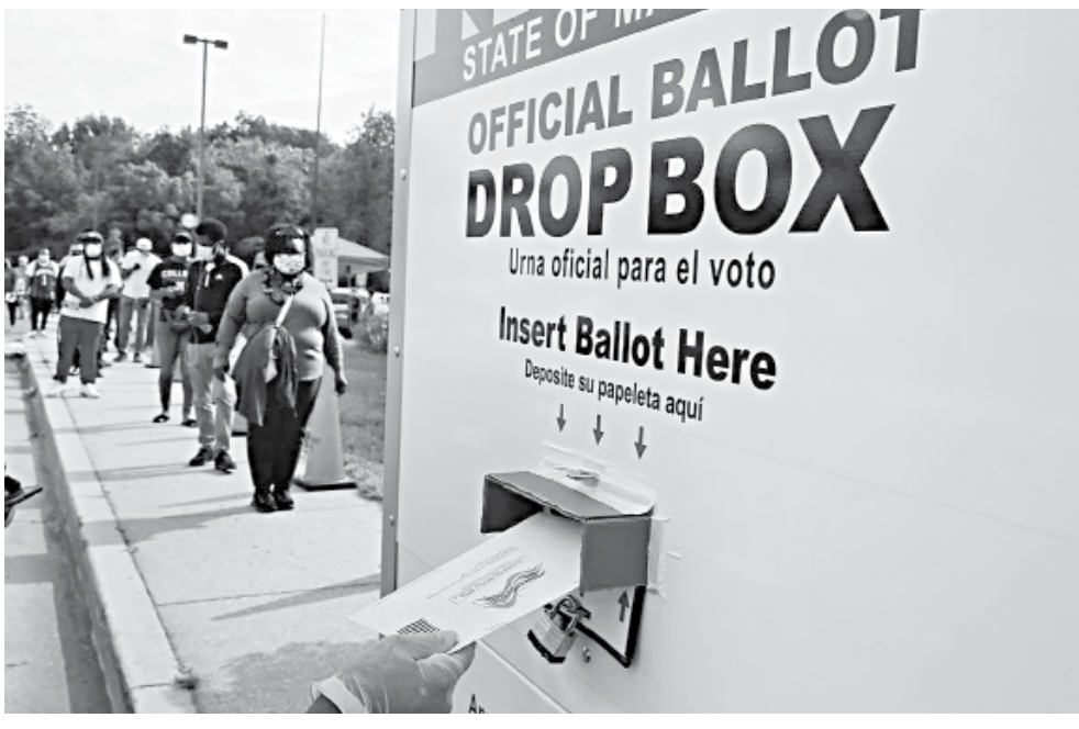
File photo of a voter placing their ballot in a curbside ballot drop box to help prevent the spread of Covid-19 during the Maryland US presidential primary election, as other voters stand in a long line waiting to cast their votes, on June 2, 2020.

legitimate messages from fake news will not only be a task of the voters but also of the campaigns themselves. Evidently, these developments will make campaigning more like an “information war” than an election campaign. Campaign expenditures will increase, consequently the war chests of candidates may become a serious determinant to the success. The second challenge is to make people vote. Considering the health risks associated with in-person voting, there is a growing demand for expanding the options for voting by mail. There are two ways of mail-in voting: universal mail-in voting, where all voters can vote by mail, and absentee balloting, where the voters can ask for a ballot via mail. Five states—Colorado, Hawaii, Oregon, Washington and Utah—have had the universal mail-in balloting system for a long time, while three states—California, Nebraska