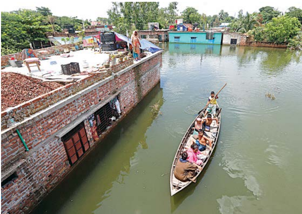
A woman standing on her rooftop watches people on a boat pass by what should be her back yard. Everything downstairs is soaking wet as floodwater ravages the neighbourhood in Makkahnagar area of Savar. Thousands of villages have gone under water and millions have lost everything over the past few weeks.