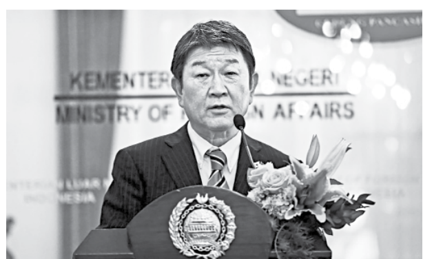
Japanese Foreign Minister Toshimitsu Motegi

The total value of bilateral trade in 2019 was 31.6 billion pounds ($41 billion) according to British data, a figure London hopes to increase by about 15 billion pounds a year in the long run.