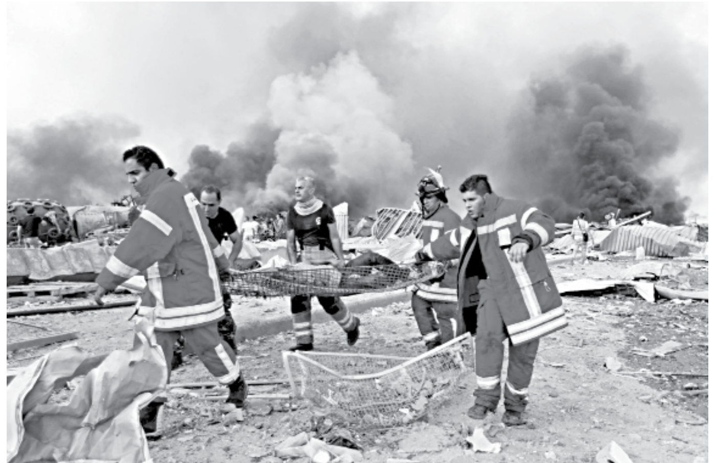
A man is evacuated at the site of a massive explosion in Beirut, Lebanon, on August 4, 2020.

September of that year it had to dock at the Beirut port after encountering technical difficulties. The owner and crew of the vessel had to abandon it apparently because the Lebanese authorities did not allow it to sail. The chemical was later offloaded to Hanger 12 of the port, where it remained till the explosion ripped through the capital on August 4.