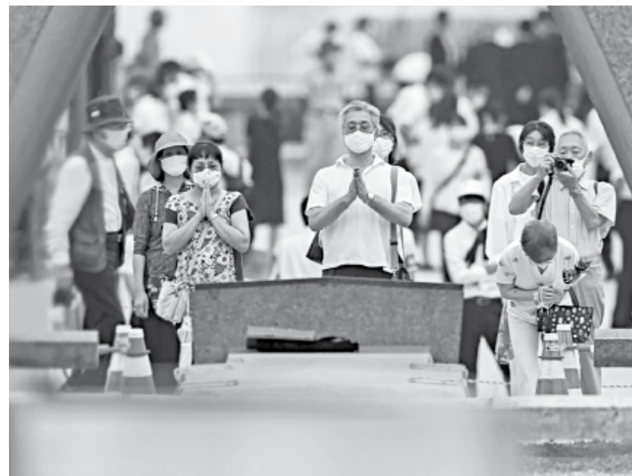
People pray in front of the cenotaph for the victims of the 1945 atomic bombing in Hiroshima.

For decades, nuclear testing led to horrific human and environmental