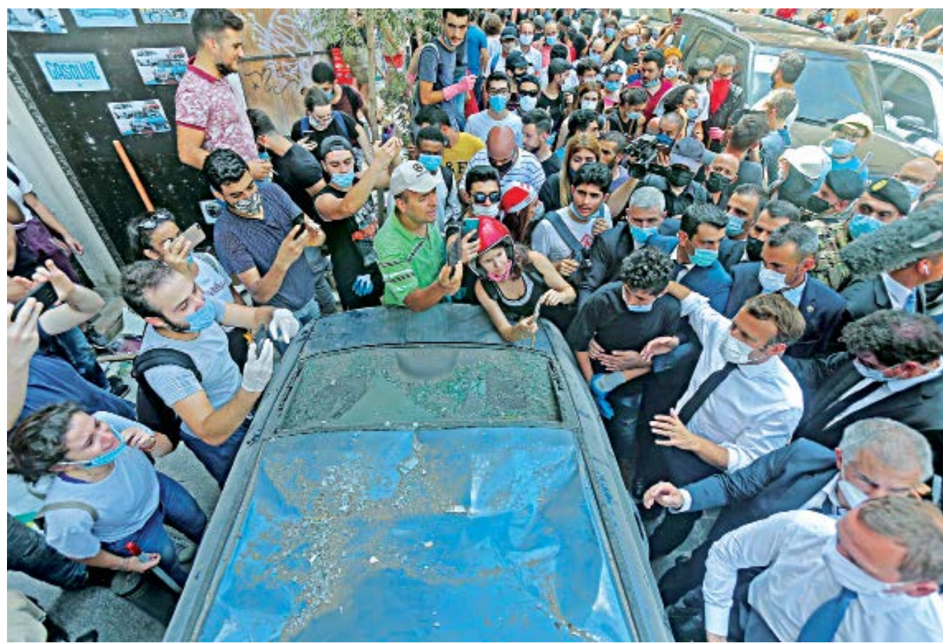
French President Emmanuel Macron talks to people during a visit to the Gemmayzeh neighbourhood, which has suffered extensive damage due to a massive explosion in the Lebanese capital, yesterday.

Rajapaksa party on course for big Sri Lanka election win Sri Lanka's ruling party took a clear lead yesterday in early results from parliamentary elections in which the dominant Rajapaksa family hope to strengthen their grip on power. Counting in the island's south showed Prime Minister Mahinda Rajapaksa's Sri Lanka Podujana Party with 72 percent of the vote. Since the prime minister's younger brother Gotabaya won a presidential election in November, Sri Lankans have largely embraced the family's populist platform. The policy programme emerged from a wave of nationalist sentiment that followed Easter bombings in 2019 by Muslim radicals which killed 279 people. The brothers are viewed as heroes by the country's Sinhalese majority for orchestrating a ruthless military campaign to end a decades-long Tamil separatist war in 2009 under the leadership of Mahinda. Final results were expected late yesterday.