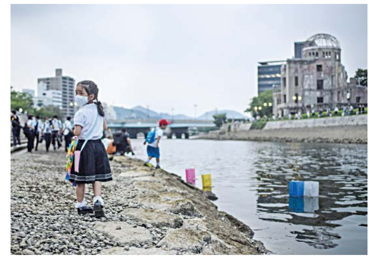
A girl stands along the riverbank as paper lanterns are released on Motoyasu River in front of ruins of the Hiroshima Prefectural Industrial Promotion Hall, now commonly known as the atomic bomb dome, in Hiroshima, yesterday. Japan yesterday marked 75 years since the world's first atomic bomb attack, with the Covid-19 coronavirus pandemic forcing a scaling back of annual ceremonies to commemorate the victims.

AFP, Washington US Secretary of State Mike Pompeo on Wednesday offered a $10 million reward aimed at preventing foreign interference in the November election, as the State Department accused Russia of waging an increasingly sophisticated disinformation campaign. The reward marks one of the most public signs that members of President Donald Trump's administration are taking election meddling seriously, despite anger by Trump himself over findings that Russia has assisted him. Pompeo pointed to efforts by "Russia and other malign actors" as he announced the effort to stop election interference. The United States "is offering a reward of up to $10 million for information leading to the identification or location of any person who, acting at the direction or under the control of a foreign government, interferes with US elections by engaging in certain criminal cyber activities," Pompeo told reporters. US intelligence concluded that Russia interfered in the 2016 election to support Trump, especially through manipulation of social media, although it did not find that his campaign colluded with Moscow. Trump has been outraged by the "Russia hoax" and in February removed the director of national intelligence over a briefing to lawmakers that found that Russia appeared to want Trump to win a new term on November 3. US officials have also warned less specifically about China's efforts to manipulate polls.