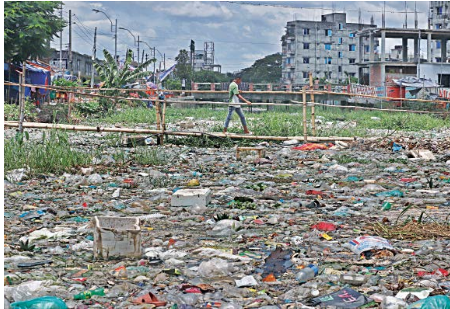
What used to be a canal has become a pit of floating garbage in Nandipara of the capital's Khilgaon. Waste from a nearby kitchen market and floodwaters have been making their way into the water body for years now, turning it into a perfect breeding ground for Aedes mosquitoes and more.