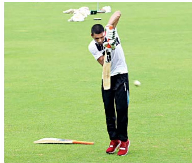
Bangladesh batsman Mahmudullah Riyad was seen practising at the Sher-e-Bangla National Stadium in Mirpur yesterday.

Former India head coach Gary Kirsten, who was appointed by the Bangladesh Cricket Board as a consultant in the past and oversaw the selection of Steve Rhodes as head coach in 2018, took part in a virtual meeting of the Bangladesh national cricket team yesterday. Members of the national squad had a few virtual meetings since the Covid-19 outbreak, with head coach Russell Domingo and his staff conducting the meetings. It was Kirsten who shared his experience with the 'Tigers' and the coaching staff yesterday. The meeting lasted more than an hour where the former South African opening batsman shared his experience both as a player and also as a coach. Few of the cricketers relayed their queries to Kirsten as the players are gearing to get back to the field following a long break from cricket since mid-March. "Mainly he (Kirsten) discussed on how we could return to cricket and the areas that we need to focus on and things like that. It was a pretty general meeting where we all took part in the discussion," one of the members of the national squad, requesting anonymity, told The Daily Star. Following the long break, a number of national team members have already begun individual practice at BCB's facilities across the country, with more players showing interest to start training from August 8.