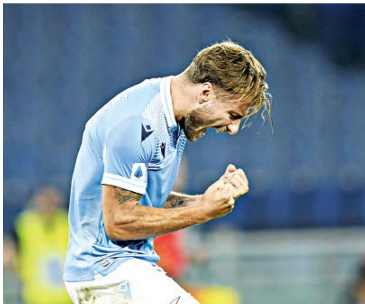
Ciro Immobile and Zlatan Ibrahimovic were ecstatic in celebrations during their respective Serie A games on Wednesday. Immobile boosted his chances of clinching the top scorer award as he netted his 35th goal of the season, moving four clear of Juventus forward Cristiano Ronaldo during Lazio's 2-0 win against already-relegated Brescia and he now has a shot to go ahead of Robert Lewandowski, who had 34 goals. Meanwhile, Ibrahimovic scored twice to help AC Milan win 4-1 at Sampdoria. It was the second time in three matches that the 38-year-old has got a brace. On the other hand, Juventus, who won a record-extending ninth straight Serie A title on Sunday, fielded a much-changed team and lost 2-0 at Cagliari.

Ibrahimovic left LA Galaxy and joined Milan in January this year, making 17 appearances so far.