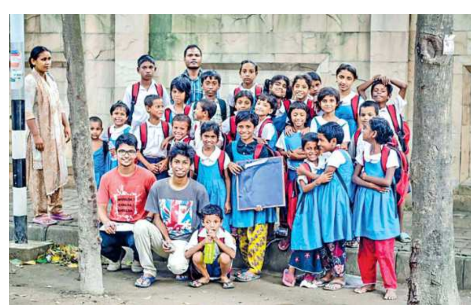
Perception Foundation's members and volunteers with the school kids from Project Dream.

responsible for bringing, sorting out and handing out food packets to underprivileged groups, including day labourers in their localities, for iftar. Around 300 people benefitted from this project in Uttara, this year. During winter, their volunteers collect donations and winter clothes from people in the city. They use the monetary donations to buy winter clothes for those in need. Last