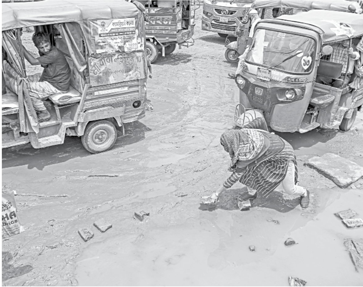
A woman quite literally creates her own path while walking through Chattogram's Naya Bazar, as she places a brick piece to step on, in order to avoid muddy water accumulated on the road. Waterlogging has been a long-standing problem in the port city, and road development work going on in the area has only added to commuters' woes. The photo was taken on Wednesday.