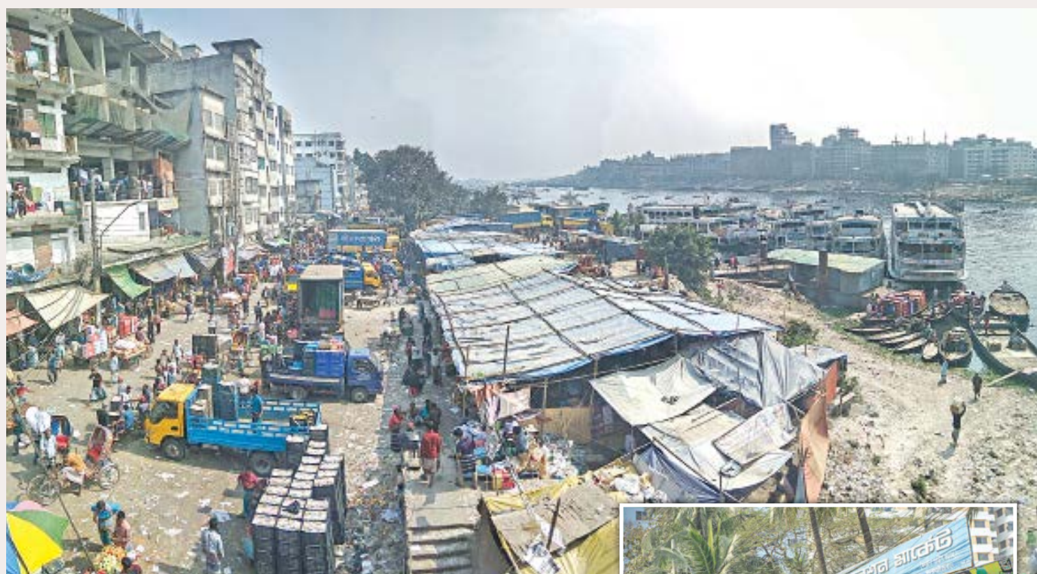
Illegal structures built on the southern side of Buckland Bund at Badamtali Ghat near Sadarghat terminal in the capital. This part of the dam is under the supervision of the BIWTA. Inset, a city corporation market set up illegally on the northern side of the dam near the terminal. The photos were taken recently.