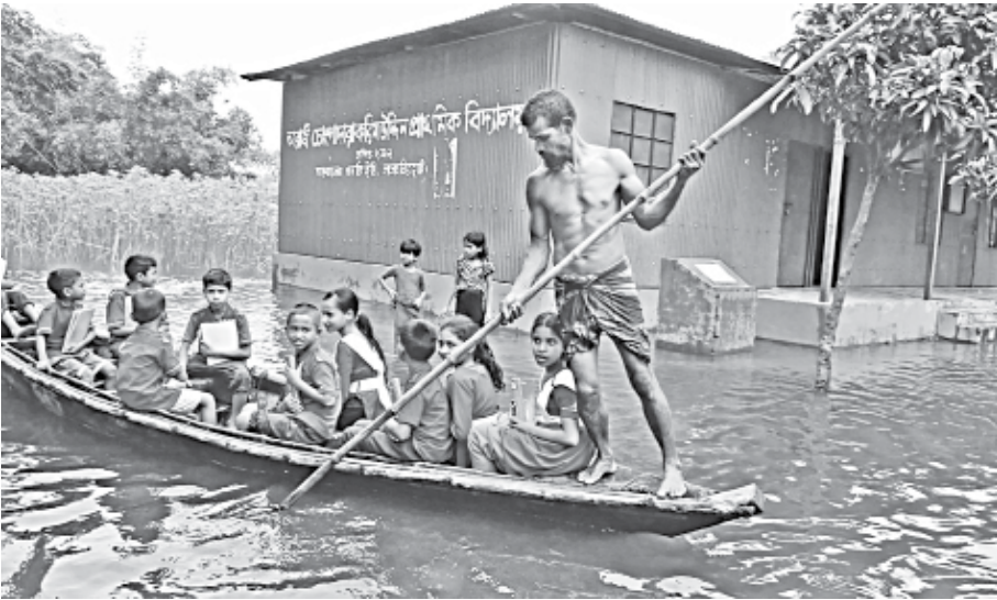
Non-economic loss and damage, such as mental health impacts on people as well as the adverse impacts on education, need to be identified and managed.

elevated global mean atmospheric temperature by over one degree Centigrade. Similarly, the hurricane Hanna that has just hit the coast of Texas in the United States is also being attributed to human induced climate change. Similar attributions are being made for wildfires that have occurred in Australia last year and in California this year, as well as floods around the world, including the ones we are suffering from in Bangladesh