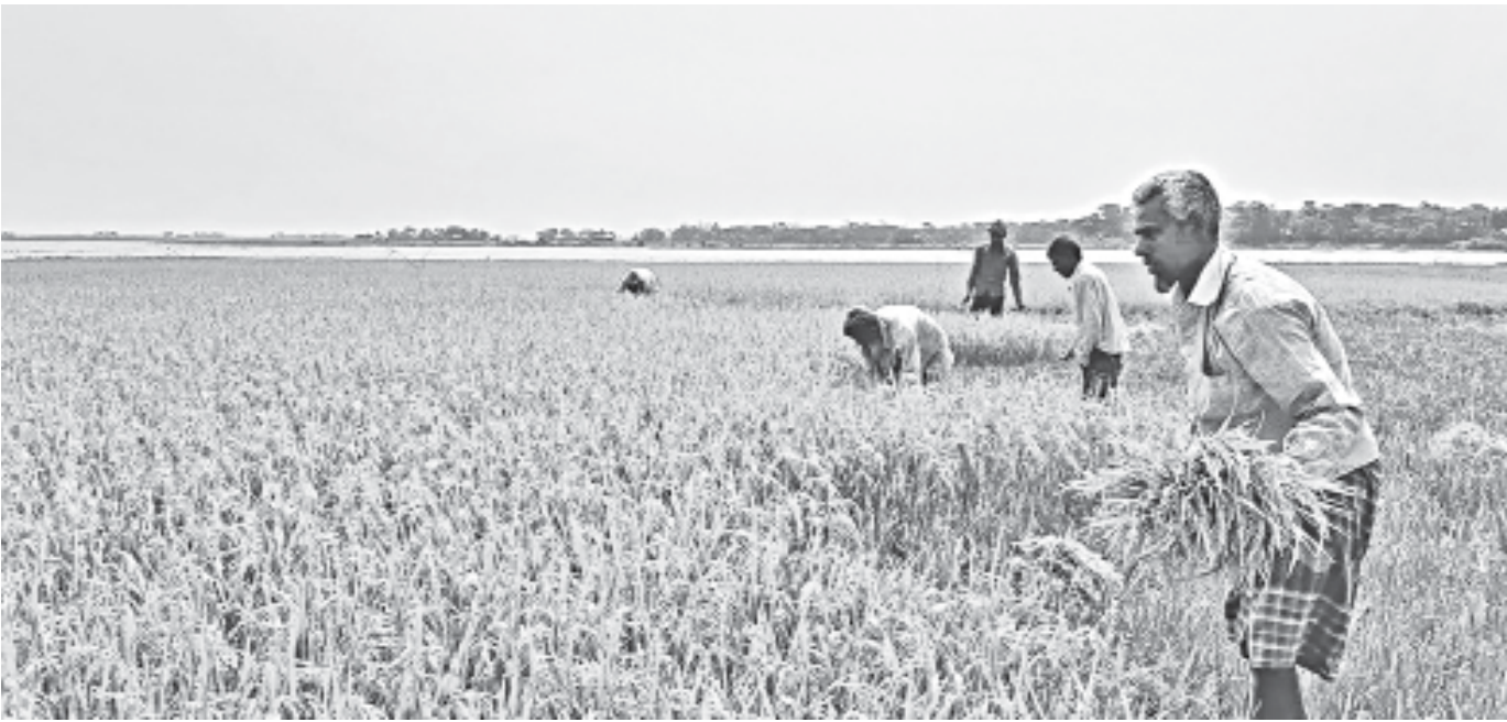
It was observed that 63 percent of the agricultural workers had less than 30 days of work during Boro harvesting time this year.

Bangladesh are facing severe food-related distress as a result of inadequate income during the coronavirus pandemic. The perspective survey conducted over phone at the end of June 2020 shows that 53 percent of the families are maintaining their living standards by borrowing money from multiple sources such as relatives, neighbours and microfinance agencies. Some of them are also taking money as advance wages from potential future employers, which in turn will cause In the above mentioned assessment, it was observed that 63 percent of the agricultural workers had less than 30 days of work during Boro harvesting time this year. One such member of an extreme poor household, Maleka Begum (not her real name) of Shahagola union of Atrai in Naogaon district, said that her husband used to work at least 90 days during the Boro harvesting period in other years, but this year he could manage to work for 22 days only.