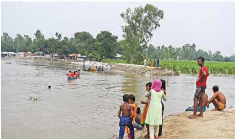
A part of Balua Flood Control Dam on the Bangalee river is breached in Gaibandha's Gobindaganj upazila affecting 20 villages.

FROM PAGE 1 A total of 1,84,833 people have been affected by flood in the district as the Padma river is flowing 119 cm above the danger mark, recorded at the Goalanda ghat point.