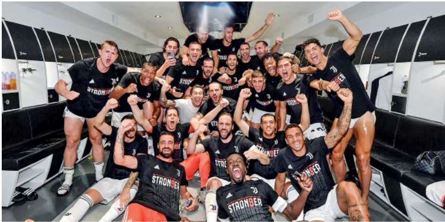
ON CLOUD NINE: Juventus players erupted in wild celebrations at the dressing room after clinching their ninth straight Serie A title following a 2-1 win over Sampdoria on Sunday.