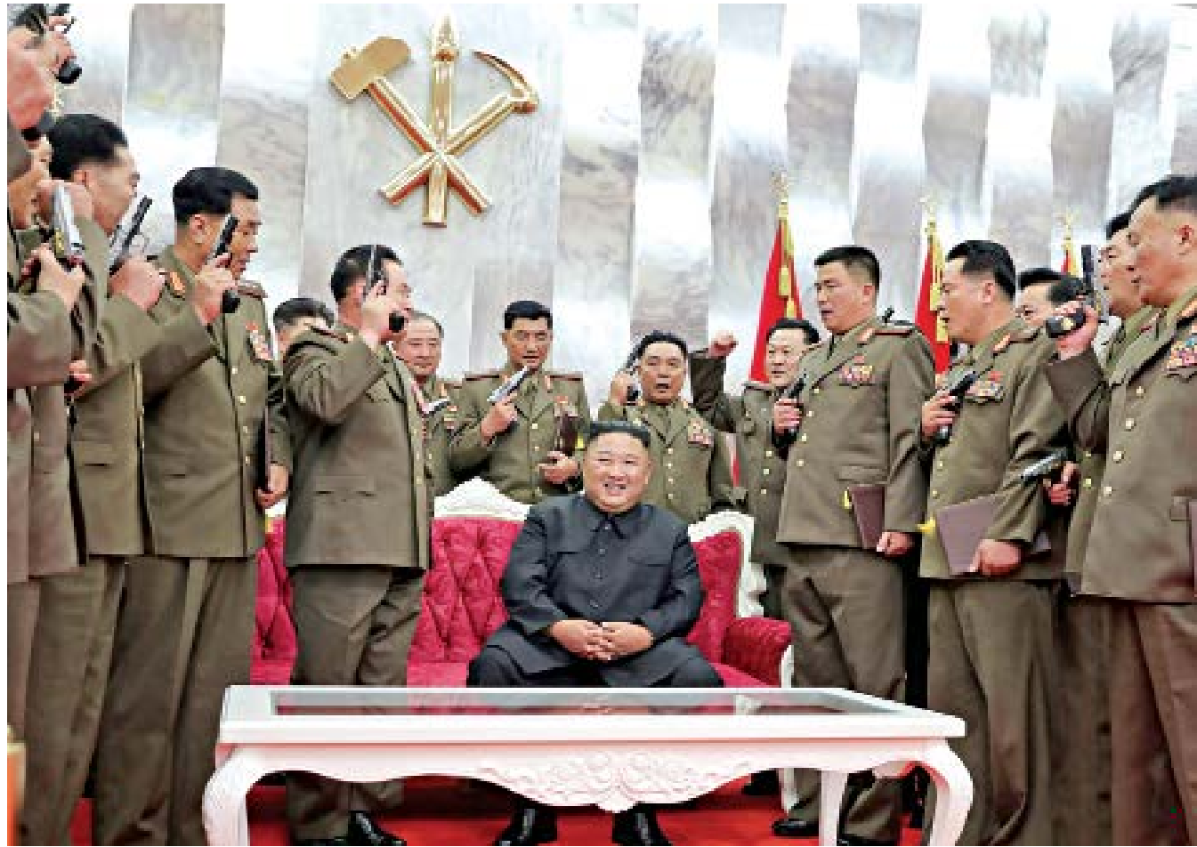
This picture taken on Sunday and released from North Korea's official Korean Central News Agency (KCNA) yesterday shows North Korean leader Kim Jong Un attending a ceremony to confer "Paektusan" commemorative pistols on leading commanding officers of DPRK armed forces on the occasion of the 67th anniversary of the Korean War ceasefire in Pyongyang.