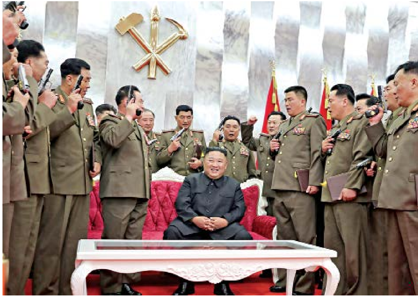
This picture taken on Sunday and released from North Korea's official Korean Central News Agency (KCNA) yesterday shows North Korean leader Kim Jong Un attending a ceremony to confer "Paektusan" commemorative pistols on leading commanding officers of DPRK armed forces on the occasion of the 67th anniversary of the Korean War ceasefire in Pyongyang.