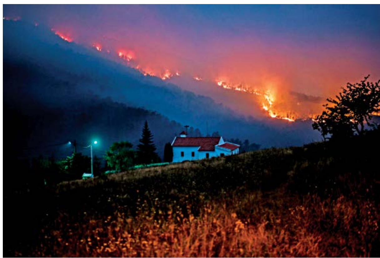
A wildfire burns in Vale da Cuba near Isna village, Castelo Branco, on Sunday night. More than 850 firefighters brought the huge wildfire sweeping across part of central Portugal under control yesterday as the country entered a state of alert due to the high risk of further outbreaks.

It said the rising tensions could lead to "unprecedented catastrophe".