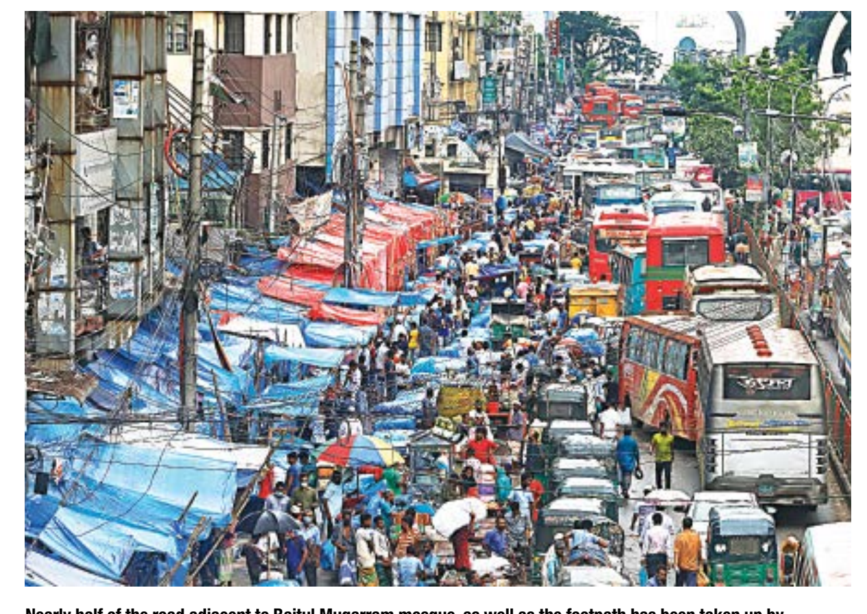
Nearly half of the road adjacent to Baitul Mugarram mosque, as well as the footpath has been taken up by makeshift stalls and hawkers, with some vehicles parked here and there as well. Movement has become restricted to just one lane, creating heavy congestion. The photo was taken yesterday.

Contacted, sources from the Divisional Health Office under the DGHS tried to SEE PAGE 4 COL 2