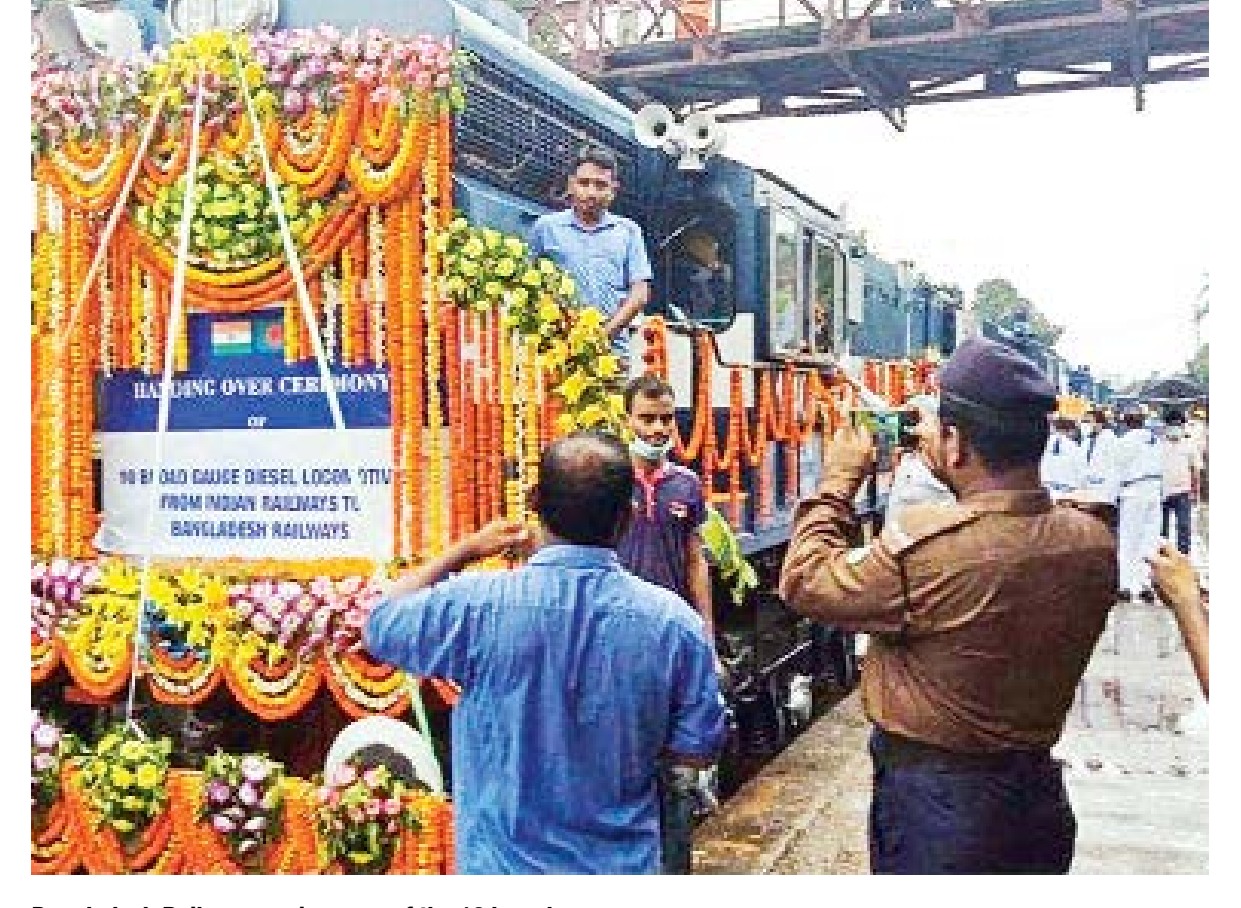
Bangladesh Railway receives one of the 10 broad gauge locomotives through the Gede-Darshana border.

Three-fourth of 18 percent household's income comes from remittance and for 14 percent households, remittance constitutes half of the family income, it said.