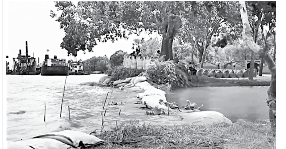
Workers of Water Development Board put sandbags to prevent erosion by the Padma river in Sujanagar upazila of Pabna.

Both the public representatives also said that the entire process of the "mysterious project" deserves thorough investigation as all corresponding letters regarding the work, with the same contractor's