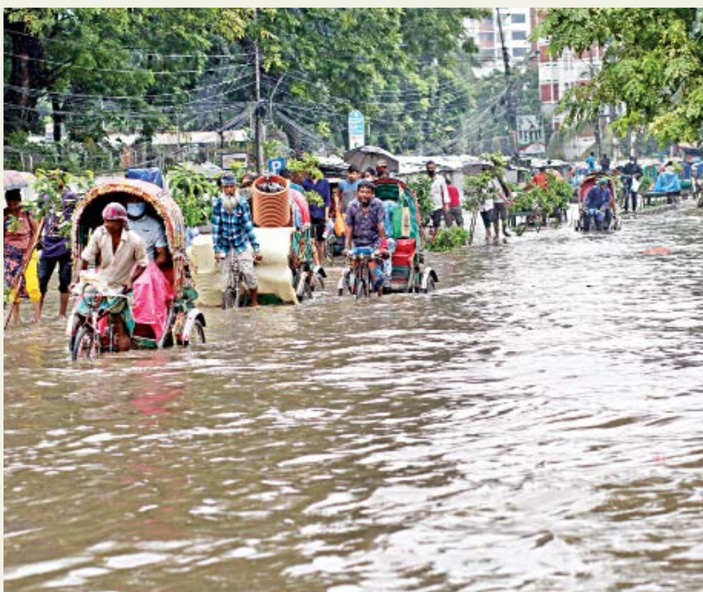
Rickshaw-pullers wade through a waterlogged street in Dhaka. The situation is not because of poor drainage system, but is one of the latest ways to ensure cleanliness of the people and protect them from Covid-19.